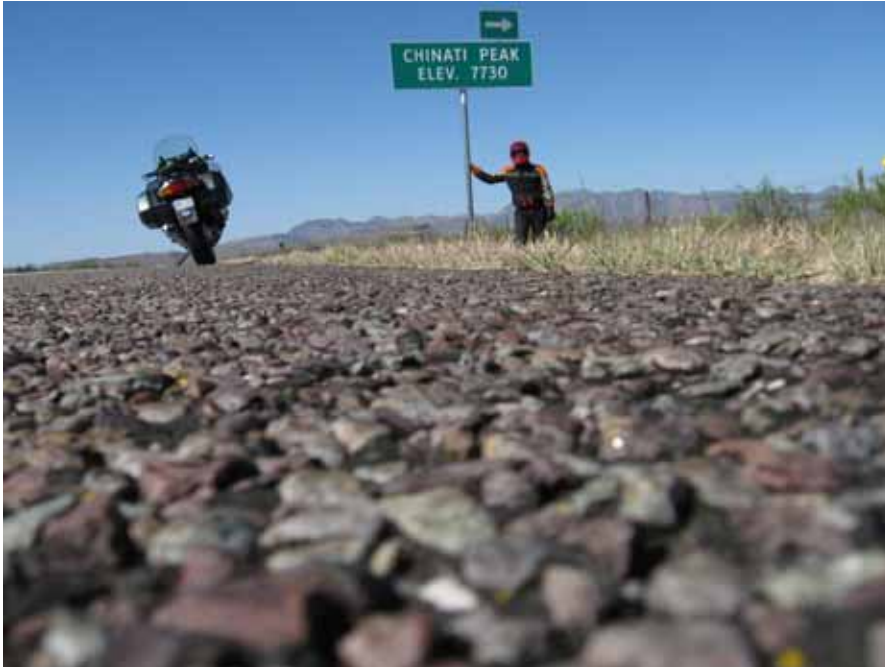
On Highway 67 just north of Big Bend National Park, by Gus Niver 4/18/08

Photo of the Month Contest (Category I, with Motorcycle)