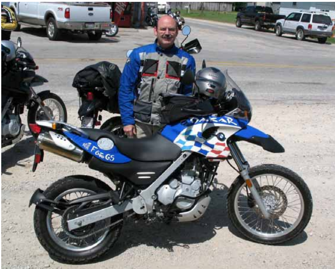
Multiple Bike Disorder?