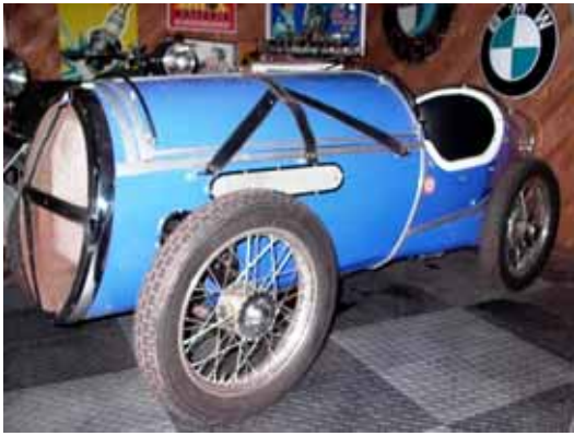
The only surviving BMW open wheel race car of a particular era, located at Blue Moon Cycle