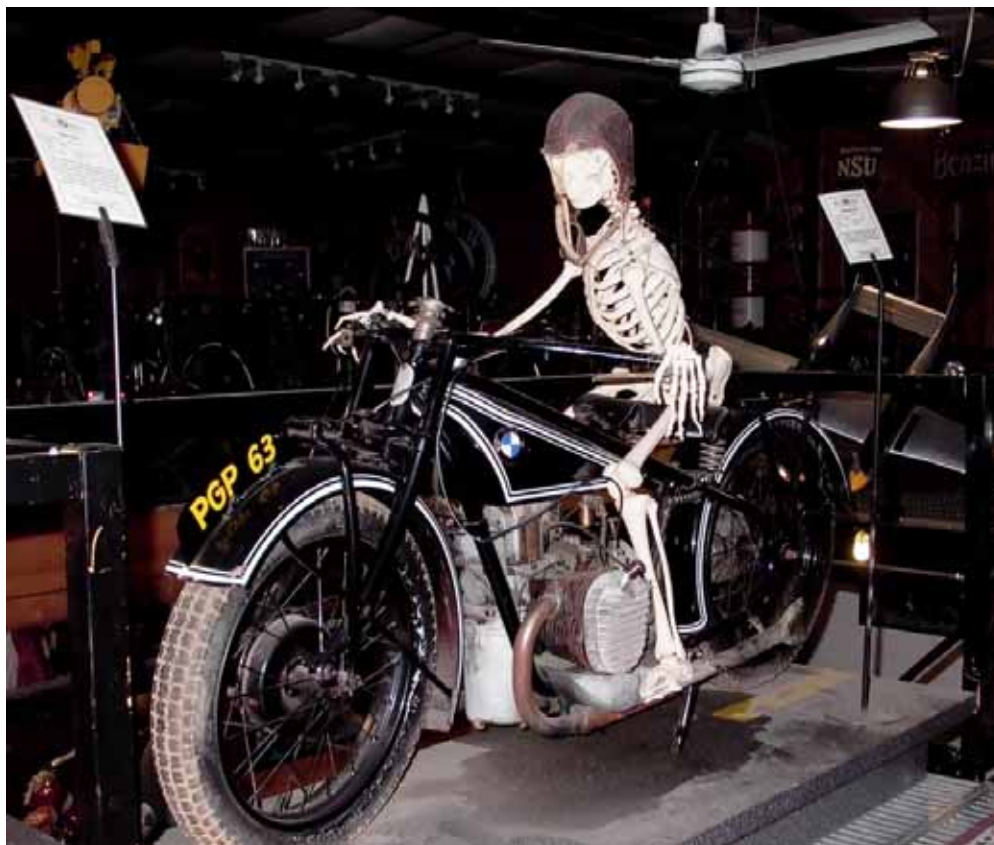
An R62, probably on museum display, but possibly awaiting death by disassembly

My son-in-law and I went up the stairs and walked through bikes packed in like sardines on three sides of the mezzanine. Many had a card describing the machine or some related facts. It was really hard to take photos. The bikes were so close together that I couldn't take one without including parts of three others in the photo. We had to turn on the lights on the back side of the loft. What a place. A mini-museum stuffed into a loft above a small dealer's store.