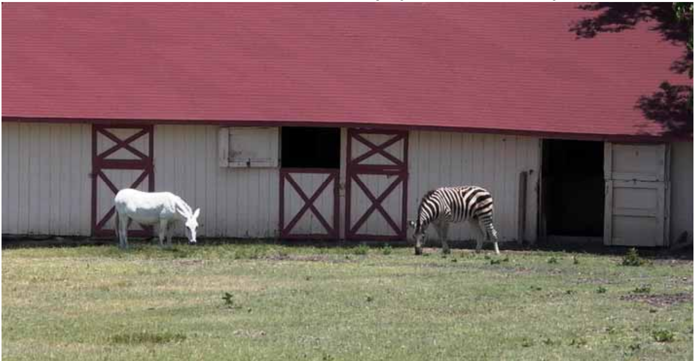
White Donkey, Test Pattern Donkey, Parker Rd, St Paul TX, June 30, 08